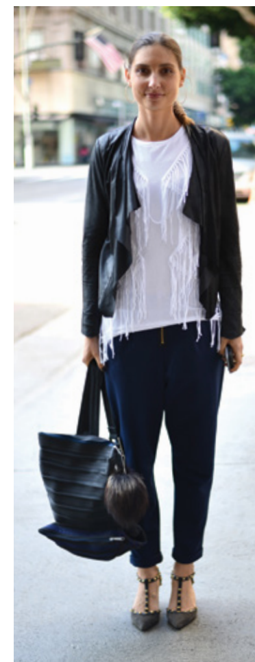
8TH STREET Ariel