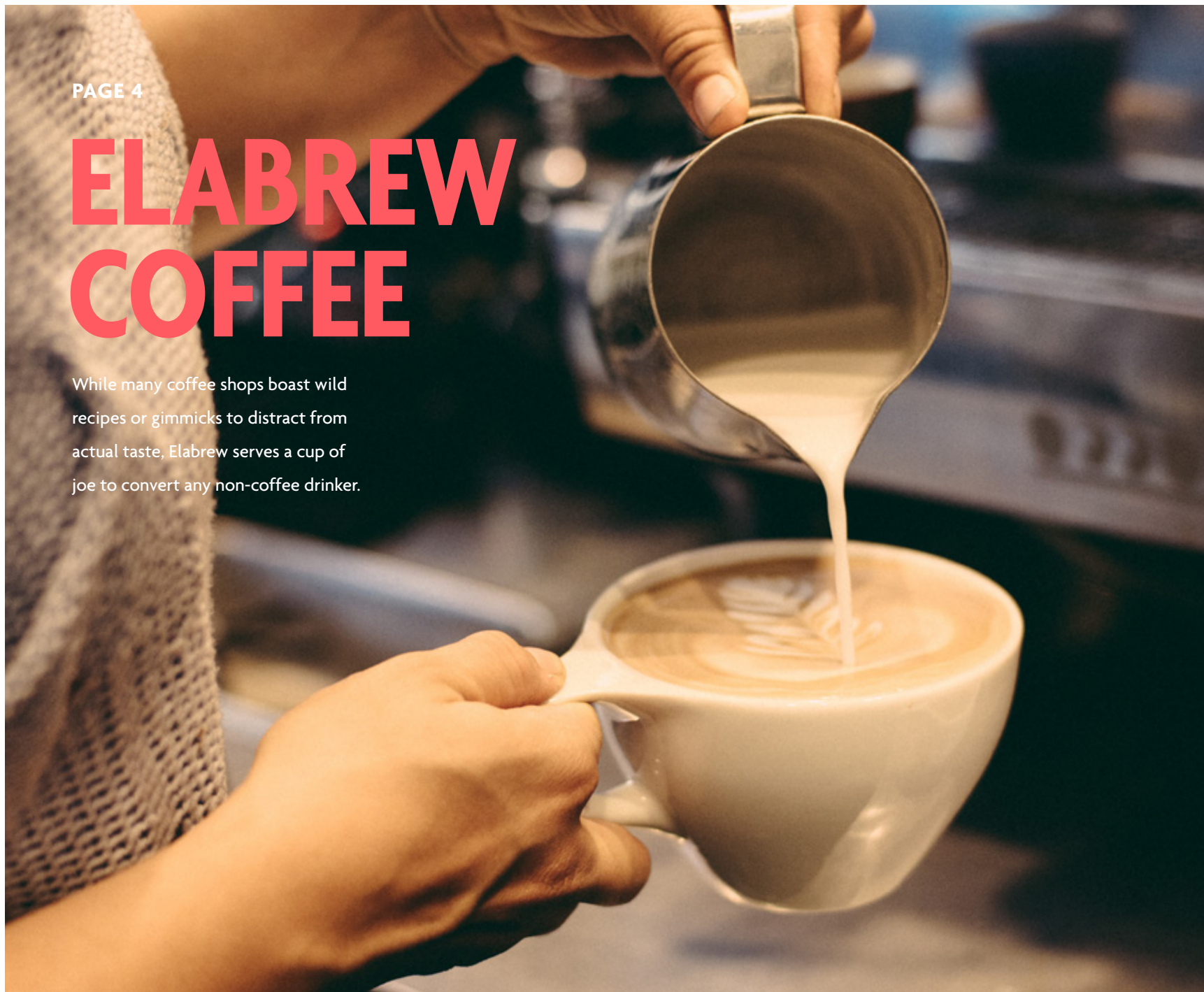
Photographed by: Alyse Gilbert

While many coffee shops boast wild recipes or gimmicks to distract from actual taste, Elabrew serves a cup of joe to convert any non-coffee drinker.