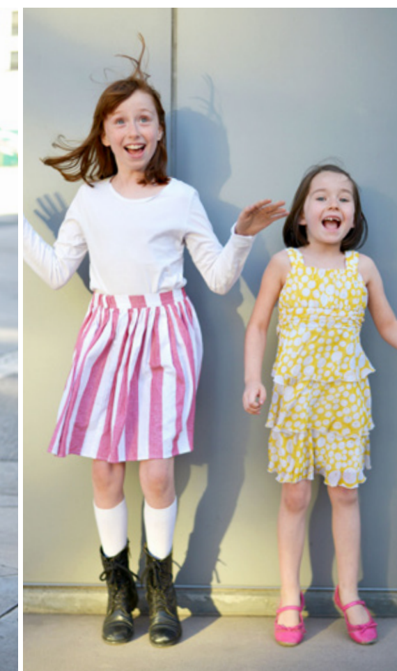
SOUTH PARK Scarlett & Djuna