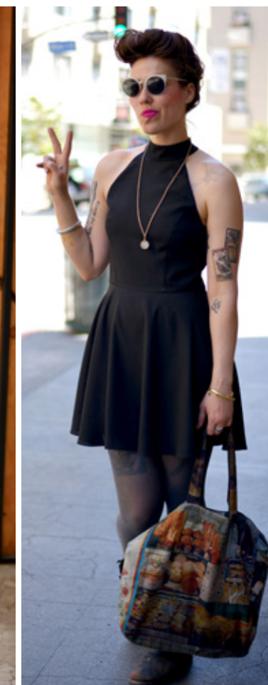
4TH STREET Bri